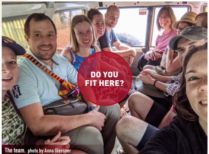
The team.

We always need more pilots and mechanics to fly the